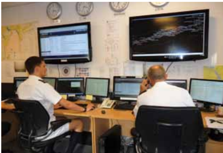
Operations room UKMTO

It is important that vessels and their operators complete both the UKMTO Vessel Position Reporting Forms and register with MSCHOA