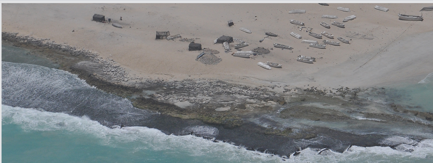
Maritime Patrol & Reconnaissance Aircraft took this image in September 2013. Skiffs are stored in remote locations all along the Somali coast. They can be readied to go to sea at a moment's notice, and frequently deploy during the hours of darkness, using routine maritime activity to conceal their transit.