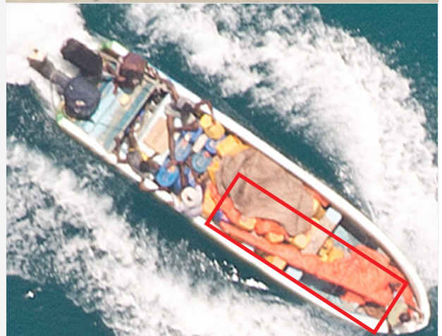
Maritime Patrol & Reconnaissance Aircraft took this image of a pirate skiff in Summer 2013. In the second image the skiff has been deployed to look for target of opportunity. Highlighted in the red box is a 3.5 metre ladder used to board high sided Merchant Vessels, it is clearly visible.