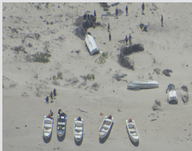
Maritime Patrol & Reconnaissance Aircraft took this image in September 2013. Skiffs are arranged on the beach prior to being put to sea as the Monsoon period comes to an end. Once the wave height reduces and the sea state improves, conditions necessary for operations become more conducive for piracy.